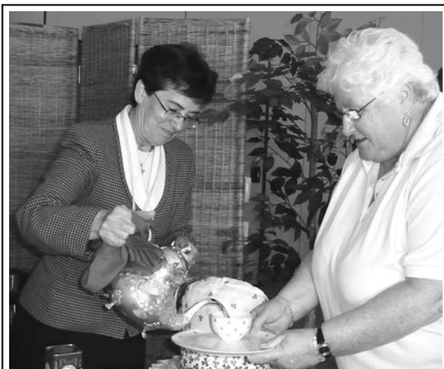
High Tea during one of Neumann College's eight one-day retreats at our Center.

When the Middle States Review commended Neumann College for “offering what the world needs for the 21st century” the administration was prompted to offer their personnel an opportunity to reflect on and share what it is that they are “offering the world.” In the series of eight one-day retreats two themes were emphasized: nurturing one’s spirit and reflecting on what Neumann offers the world through Catholic Education in the Franciscan Tradition. Secondly the day was one to say “thank you” for all the faculty has done and continues to do to promote the mission and values of the college. Each day